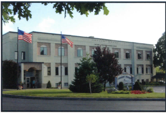
500 Whitesboro Street Utica, NY 13502